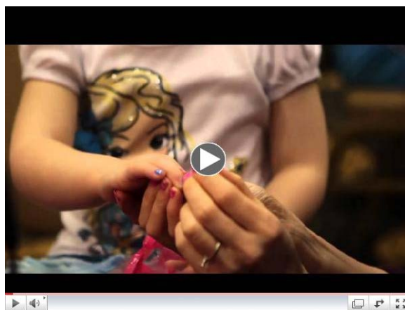
AFFEC Princess For A Day Event