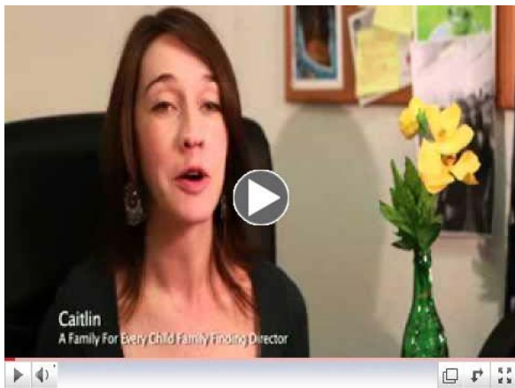
A Family For Every Child -How we, together change the numbers