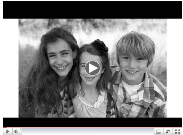
Thank you to our Volunteers