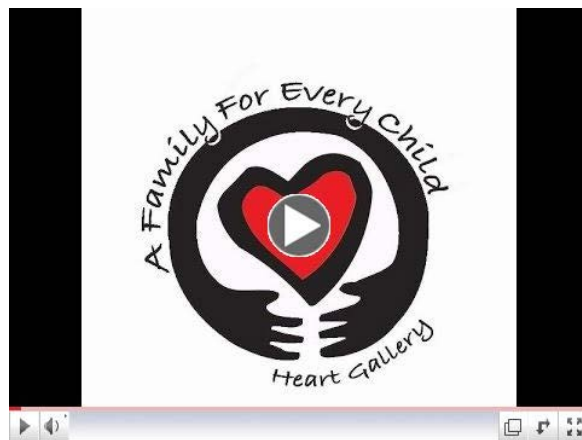
Change the world one child at a time!

A Family For Every Child 1675 W 11th Avenue Eugene, Oregon 97402 info@afamilyforeverychild.com Phone: 541-343-2856 Toll-Free: 877-343-2856