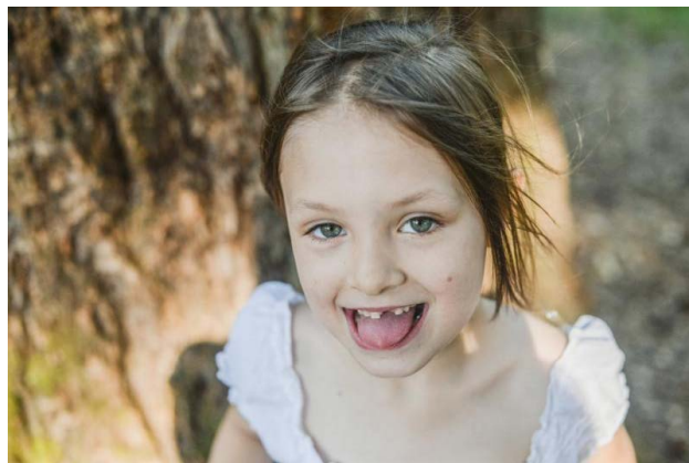
Phoenix -Age 8